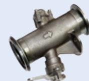
F-15 Butterfly Valve Assembly