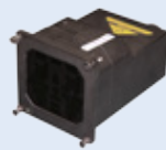
F-15 Enhanced Engine Monitor Display