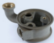
F-15 Manifold Subassembly