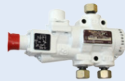
F-15 Directional Control Valve, Linear