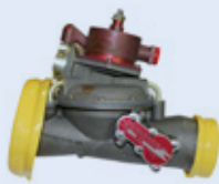
F-15 Safety Relief Valve