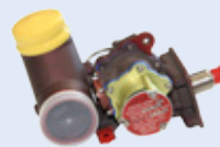
F-16 Regulating Valve