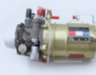
UH-60 Hydraulic Power Supply Pump