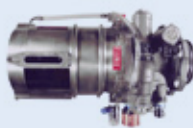
UH-60 Hydraulic Power Supply Pump