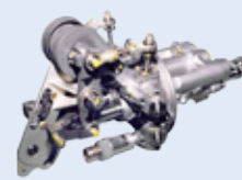
UH-60 Tail Rotor Servo Cylinder