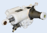
F-15 Damper Shimmy

Parker is the world's leading diversified manufacturer of motion and control technologies and associated systems. Aero Precision partners with Parker to provide distribution of spare and R&OH support for KT-1, F-15, F-16, and UH-60 aircraft in various territories.