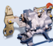
UH-60 YAW Actuator