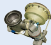
C-130 Air Turbine Starter Control Valve