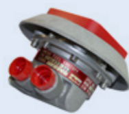
F-15 Fuel System Valve