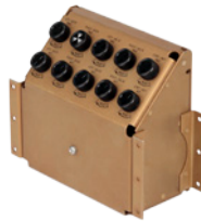
Fault Display Unit