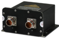
Brake Control Unit