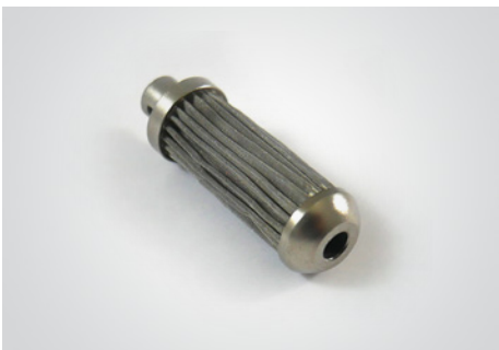
FILTER, ELEMENT, FLU

NSN: 1680-01-122-8875 P/N: 1587443-1 HONEYWELL (CAGE 64547)