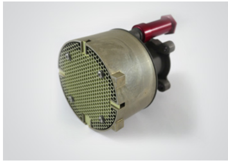
VALVE, FUEL SHUTOFF

NSN: 6680-01-118-1687 P/N: PS53B EATON (CAGE 97484)