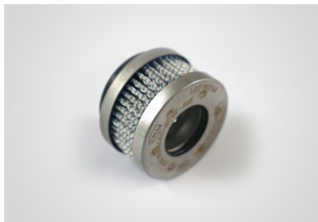
FILTER SUPPLY, CARTRIDGE

NSN: 5930-00-814-7972 P/N: 680105 KLX (CAGE 2N935)