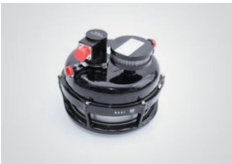
SECONDARY OUTFLOW VALVE

NSN: N/A P/N: 3107126-1 HONEYWELL (CAGE 99193)