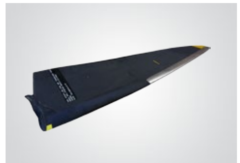
BLADE AND PIN ASSY., PROPELLER

NSN: 1610-01-563-0465 P/N: RFC11Y1P0C UTAS (CAGE 73030)