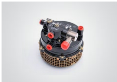
CABIN PRESSURE PRIMARY OUTFLOW VALVE

NSN: 4820-01-312-1675 P/N: 103698-1 HONEYWELL (CAGE 64547)