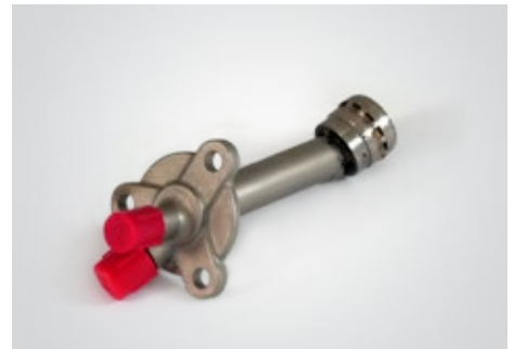
FUEL INJECTION NOZZLE

NSN: 2915-00-894-3164 P/N: 868752-1 HONEYWELL (CAGE 99193)