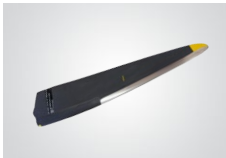
BLADE AND PIN ASSY., 14RF PROPELLER

NSN: 5977-01-494-8646 P/N: 775688-2 UTAS (CAGE 73030)