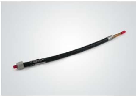
DRIVE ASSY-FLEXIBLE DOWN (FLEX SHAFT)