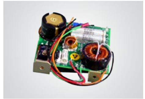
CIRCUIT CARD ASSY., ANTI-COLLISION LIGHT

NSN: 2925-01-142-9043 P/N: CH31627 CHAMPION (CAGE 0AFL4)