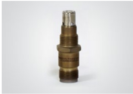
IGNITER, SPARK, GAS TURBINE ENGINE

NSN: 2925-01-142-9043 P/N: CH31627 CHAMPION (CAGE 0AFL4)