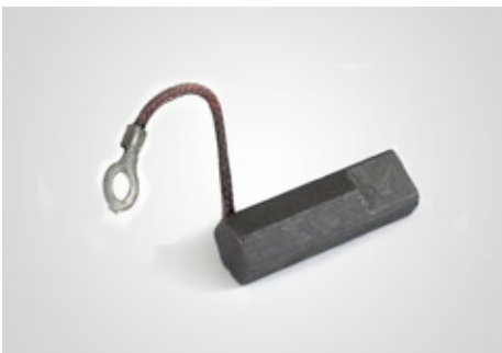
BRUSH, ELECTRICAL CONTACT

NSN: 1650-01-328-1075 P/N: AAB017-10D2A PALL (CAGE 18350)